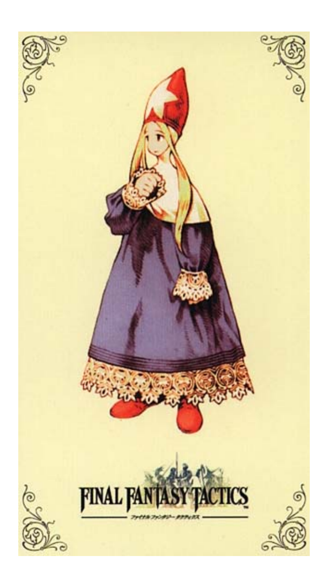
Table I-10: The Time Mage

There is also a maximum amount of MP a spellcaster can spend on a single spell. For first level spellcasters the maximum is one MP point per spell. The cap on MP expenditure increases by the sum of the old total and the time mage's new level. For example, a spellcaster who gains second level gains the sum of his old maximum (1), and the priest's new level (2) for a total MP of 3. The capacity ceases to increase at 10^{th} level, and does not stack with other spellcasting classes. The limit for first through tenth levels is 1, 3, 6, 10, 15, 21, 28, 36, 44, and 55.