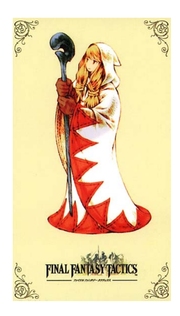
Table I-5: The Priest

There is also a maximum amount of MP a spellcaster can spend on a single spell. For first level spellcasters the maximum is one. The cap on MP expenditure increases by the sum of the old total and the priest's new level. For example, a spellcaster who gains second level gains the sum of his old maximum (I), and the priest's new level (2) for a total MP of 3. The capacity ceases to increase at 10^{th} level, and does not stack with other spellcasting classes. The limit for first through tenth levels is I, 3, 6, 10, 15, 21, 28, 36, 44, and 55. Bonus Feats: The priest gains bonus feats at 1^{st} level, and every 3 levels thereafter ( 4^{th} , 7^{th} , 10^{th} ). The priest may choose bonus feats from: (Will be added later)